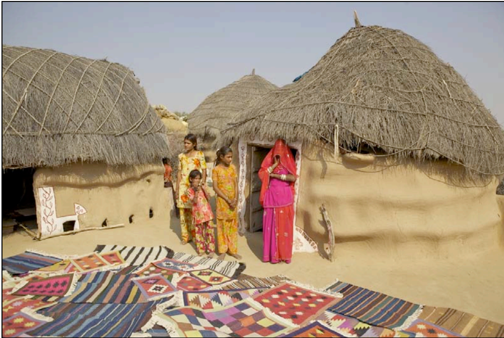
Bishnois Village, Jamba

EXPLORING JAMBA REGION The Bishnoi are known as great conservationists, to whom the protection of animal and vegetable life is a religion. Today we will explore the area in 4-wheel drive vehicles as we meet and photograph Bishnoi villagers and villages. There are also some wonderful opportunities to purchase crafts from local artisans.