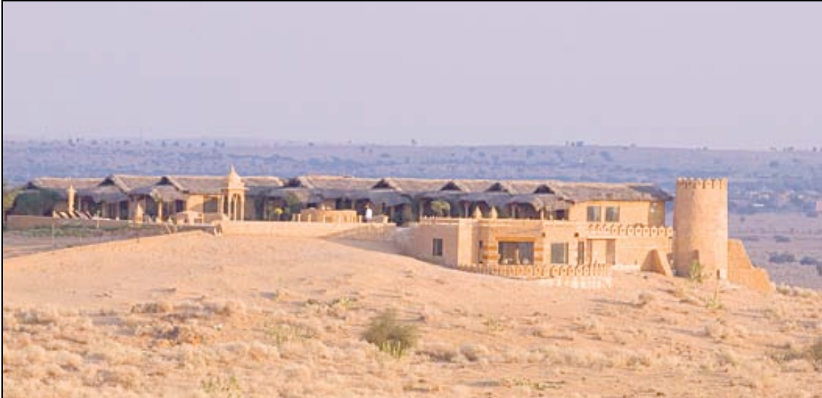
Dera Sand Dune Resort, Jamba

All Bishnois follow the 29 (bis-noi) tenets laid down by the 15 th -century guru Jambeshwar, affectionately known as “Jamba-ji.” They fervently believe in the sanctity of animal and plant life, so wildlife finds a natural sanctuary around their villages.