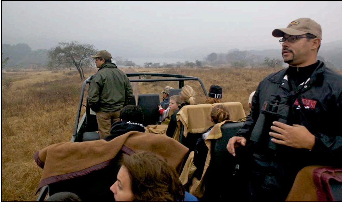
On safari in Ranthambore National Park