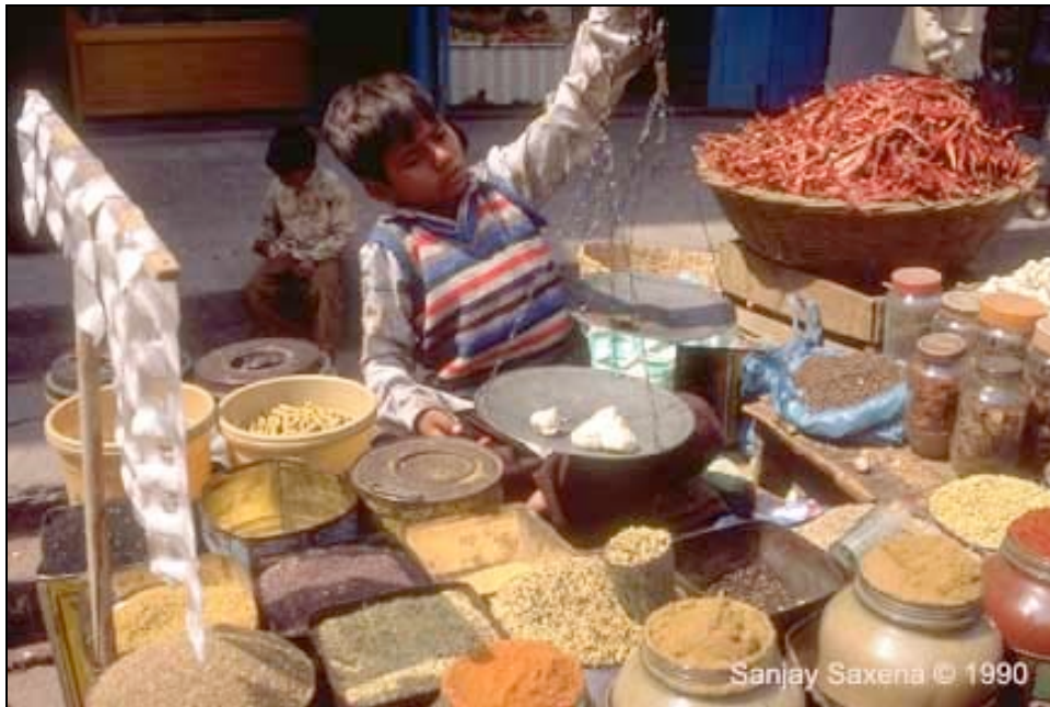
The Sites and Smells of Old Delhi

Driving past the Red Fort (you will visit the more elaborate Red Fort in Agra) we first trade our motor vehicle for a bicycle rickshaw, which will take us into the heart of Chandni Chowke (the silver square - so named because of the silver merchants). Here we can spend some time exploring the shops in the heart of the old city. Negotiating alleyways that seemingly get narrower and narrower, we end up at the Jama Masjid, the largest Muslim mosque in India.