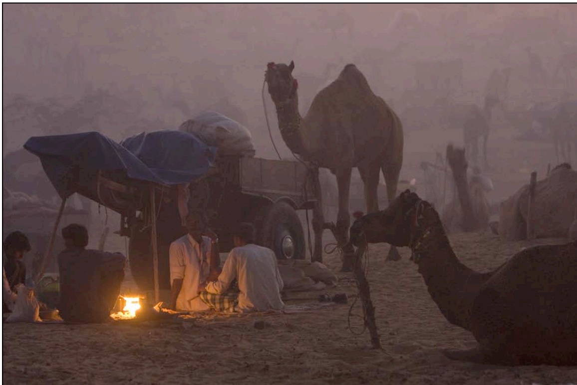
At the Pushkar Camel Fair