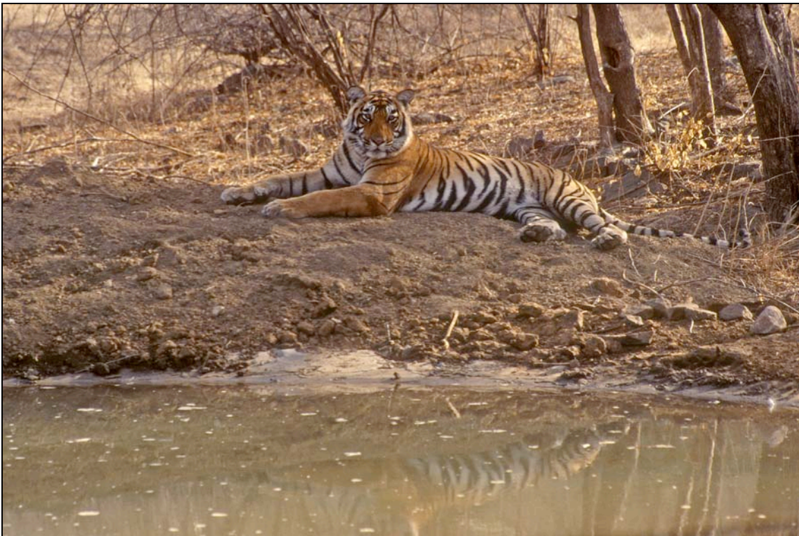
Tiger at watering hole, Ranthambore National Park