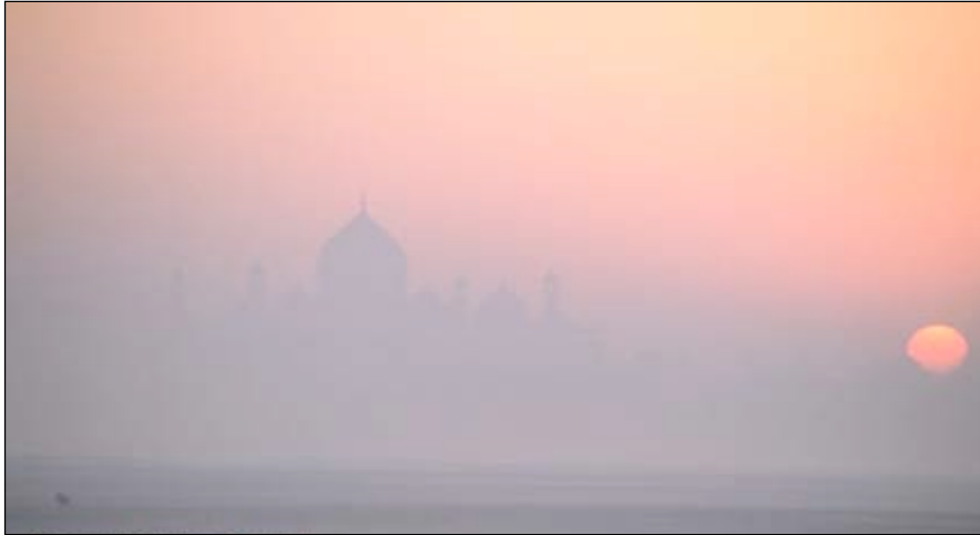
The Taj at sunrise – afloat in the morning mist

“The only way I could escape the feeling of being in a dream was to close my eyes.” - Theo Cruz