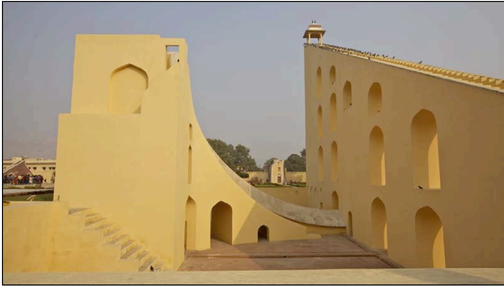
Largest sundial of the world, Jantar Mantar - Jaipur

Departing Amber Fort, we venture back inside the walls of the Pink City, stopping to photograph the exquisite Hawa Mahal. We then visit the City Palace, where the present Maharaja resides. There is a Mughal art museum, housing a lovely collection of Rajasthani & Mughal miniature painting. Part of the complex is an outdoor 18 th -century astronomical and astrological observatory (Jantar Mantar) with several incredible sundials (accurate to 2 seconds) and very modern-looking astrological markers.