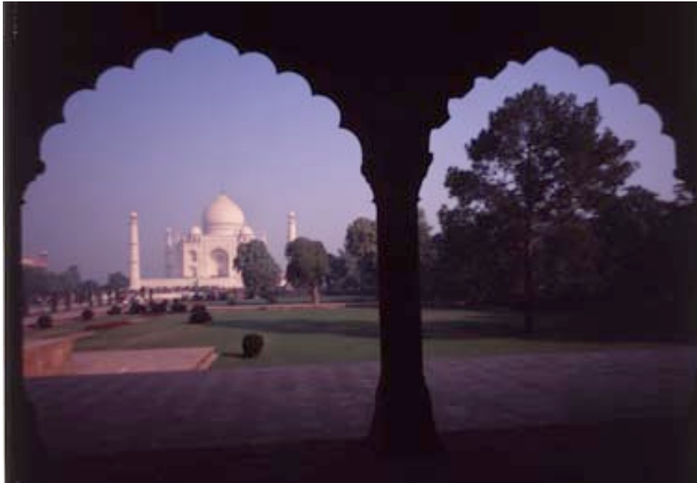
The Taj Mahal

R ajasthan is the land of the Rajputs, who have held dominion over the western deserts of India for more than a thousand years. It is one of the areas of India where great numbers of people are still to be seen in traditional garb; their adherence to tradition is proof of the tenacity of a proud heritage. Here the barren desert-scape underscores the colorful human imprint. Swirling skirts festooned with shiny embroidery, turbans of every hue, temple doors daubed with handprints, shrines garlanded with flowers; vibrant color is everywhere.